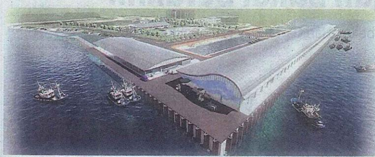
AKAN DIBINA: Lakaran artis pandangan atas Kompleks Perikanan LKIM yang bernilai RM247.84 juta.

Kemudahan di kompleks perikanan baharu itu merangkumi dewan pemasaran, pasar nelayan, blok pentadbiran, dewan serba guna, bangunan