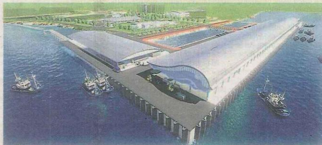
Artist impression of the fishery complex to be developed by Bina Puri in Kuching.

"This is yet another major project for Bina Puri where we are actively participating in building the economic and social progress of Sarawak," group managing director Tan Sri