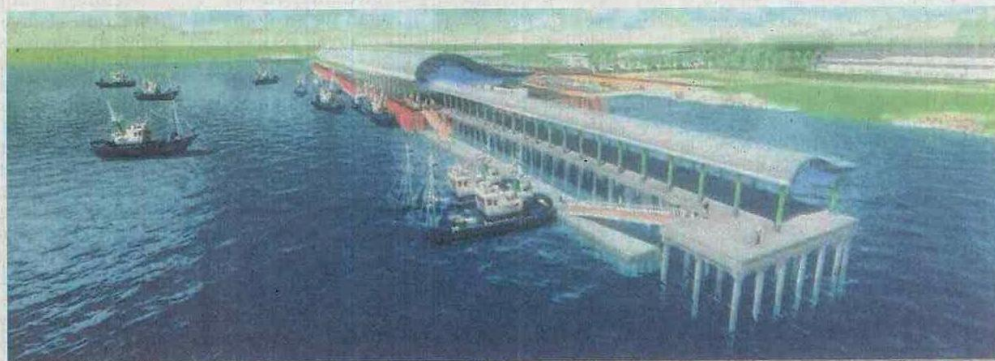
LAKARAN artis kompleks perikanan Lembaga Kemajuan Ikan Malaysia di Kuching, Sarawak yang bakal dibina oleh Bina Puri.

nampung lebih ramai nelayan dari wilayah pantai barat Sarawak berbanding kemudahan sedia ada di Bintawa di Sungai Sarawak di mana pergerakan kapal adalah terhad.