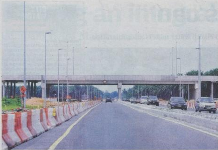
Near completion: The Latar Expressway stretches over Jalan Bukit Besar Rotan near Ijok.