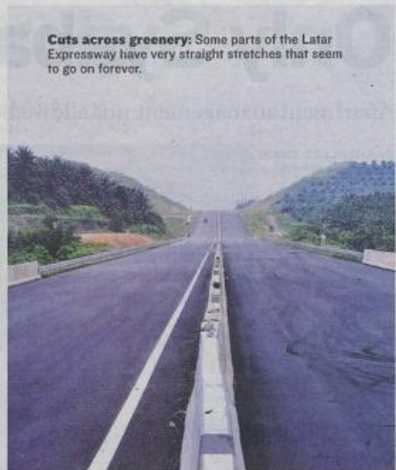
Cuts across greenery: Some parts of the Latar Expressway have very straight stretches that seem to go on forever.